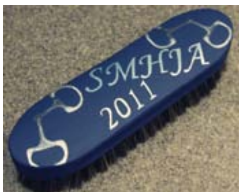
Above: Custom brushes also make a great gift if you are running low on ideas or also nice awards.

Right: This pink brush set is very pretty; it has a girly charm that you just can't beat.