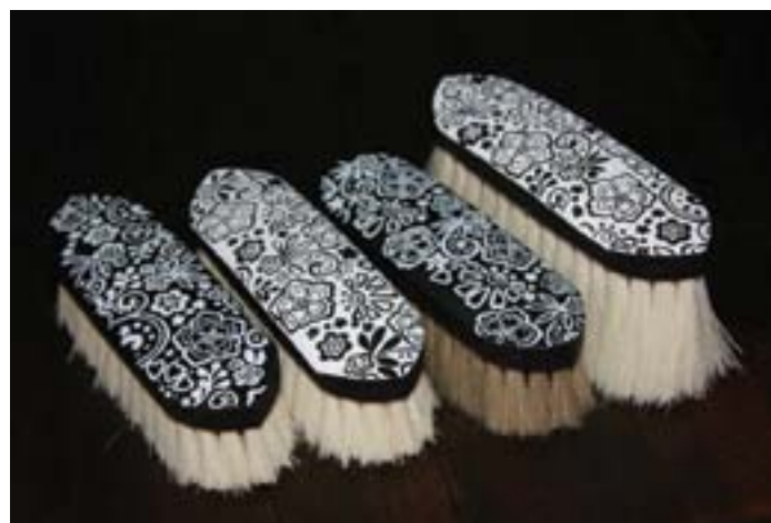
Above: Black & White paisley set; these are very pretty & flashy.

Do you need to add some new brushes? Or better yet getting a whole new grooming box? The Custom Equine can help you with that task. The Custom Equine can paint you just about any design or logo that you would like on your brushes.